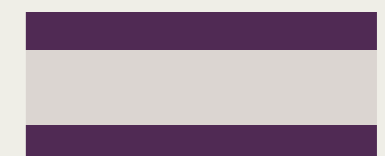
TWO SIDES CLADDING