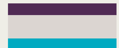
DIFFERENT LAYER MATERIALS